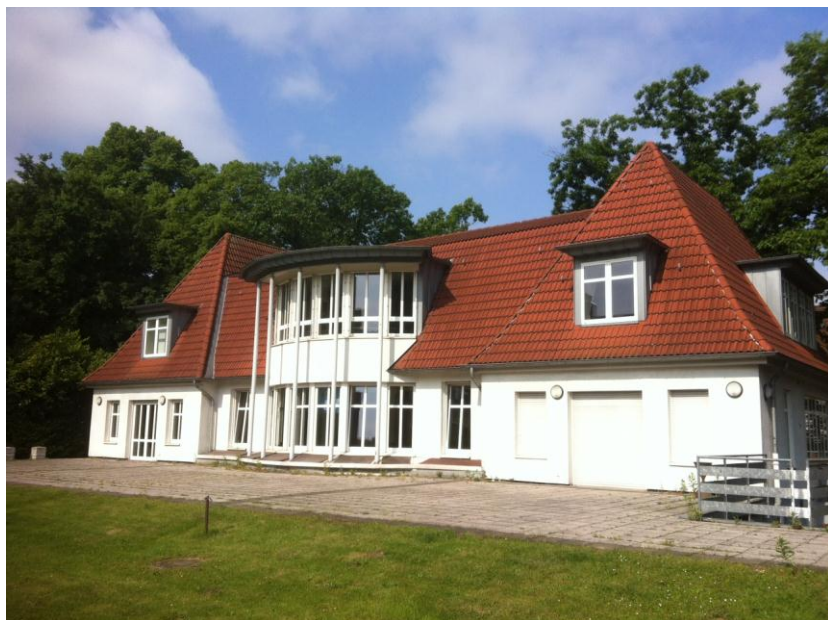
Conference venue: Gerhard-Mercator-Haus, Lotharstraße 57, 47057 Duisburg